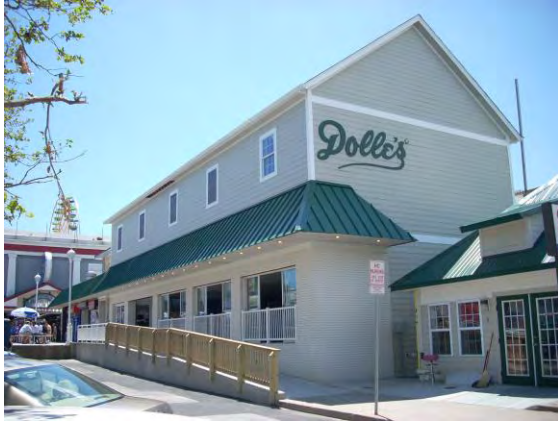
Dolle's mixed use project on Wicomico Street near Boardwalk.