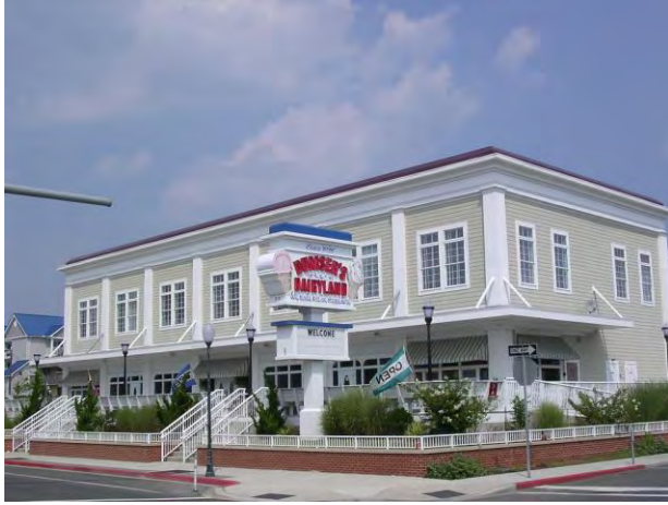
Dumsers Dairyland located on Philadelphia Avenue and Wicomico Street.