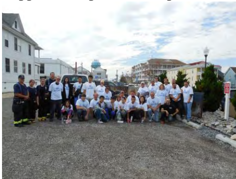
OC Clean Sweep volunteers

On November 21, 2015 the OCDC held its third annual clean-up program, called "Ocean City Clean Sweep." This event included 50 volunteers who walked the full downtown area picking up trash, cigarette butts, and many other items. Supplies and prizes were provided.