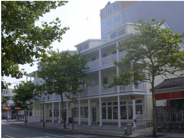
Boards Edge Villas mixed use project located at Baltimore Avenue and Talbot Street.