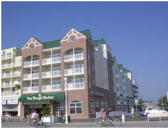
Breakers Hotel/Dough Roller Restaurant at Boardwalk and 3 rd Street.