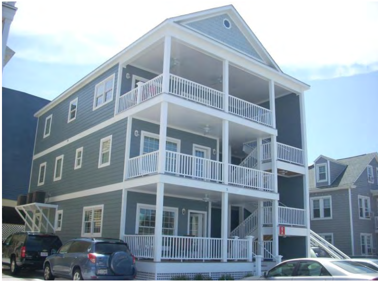
New residential building constructed in 2013 on 12 th Street.