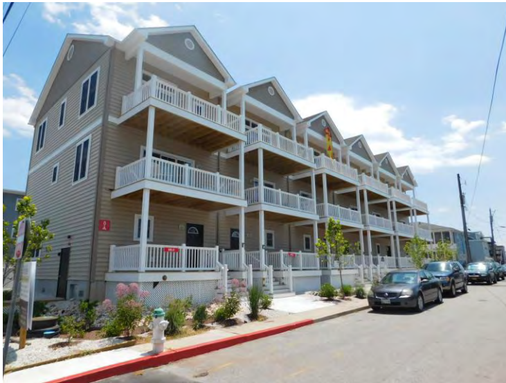
Island View Townhouses completed in 2015 at Edgewater Avenue and 5th Street.