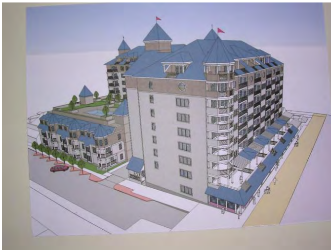
Belmont Towers mixed use project at Boardwalk and Dorchester Street.