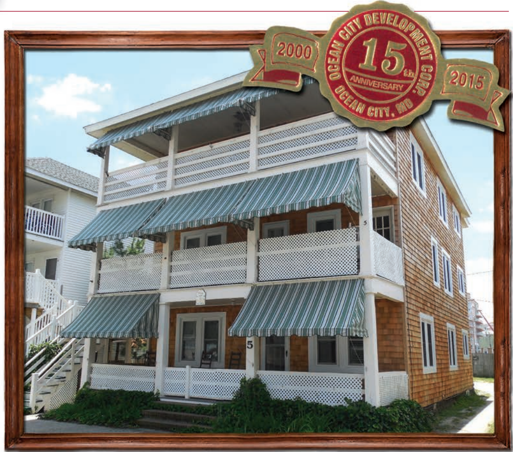
The 150th Façade project completed at 5 11th Street

As of February 2015 a total of 165 buildings have been renovated using the OCDC Façade Improvement Program in downtown Ocean City south of 17th Street. There are currently 8 façade projects underway. The OCDC Façade Program has had a tremendous impact on the appearance of many buildings. To date, over $5.7 million has been invested into downtown Ocean City through this program. These newly renovated projects greatly increase the taxable value thus benefitting all Ocean City and Worcester County residents. Funding for the OCDC Façade Program is made available from DHCD's Community Legacy Program.