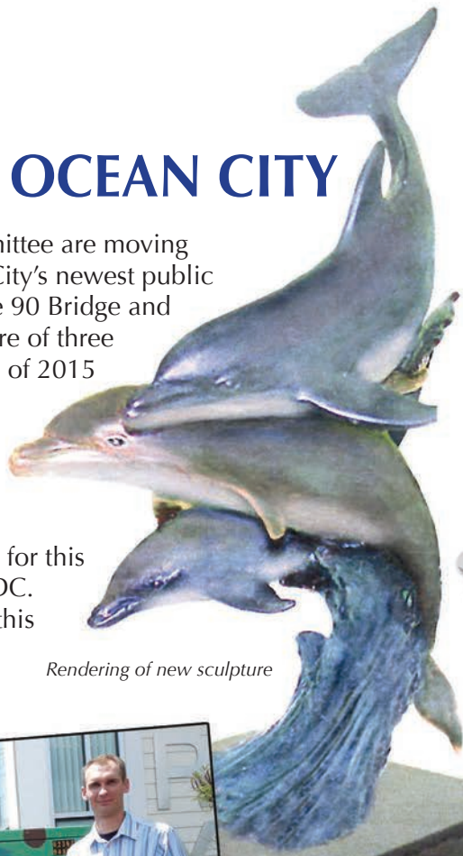
Rendering of new sculpture

The OCDC and its Public Art Committee are moving ahead with the installation of Ocean City's newest public art project to be placed near the Route 90 Bridge and Coastal Highway. This bronze sculpture of three dolphins will be installed in the spring of 2015 on a concrete pedestal. The sculpture is being completed by noted Eastern Shore artist David Turner of Turner Sculpture. A small park like setting will complement this public artwork. Contributions and sponsorships to pay for this artwork are available through the OCDC. For information about contributing to this project please contact the OCDC.