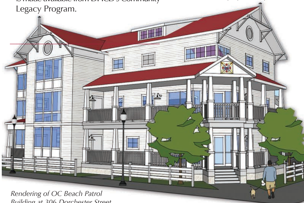
Rendering of OC Beach Patrol Building at 306 Dorchester Street