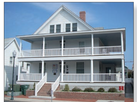
Tarry-A-While Guest House located at 108 Dorchester Street

For its eighth year, the OCDC has provided and managed seasonal housing for Town of Ocean City seasonal employees. Since 2007 thirteen employees have resided at the Tarry-A-While Guest House that was constructed in 1897 and fully renovated in 2007. Ten additional Beach Patrol employees were provided housing at 110 Somerset Street. Additional employee housing for season City staff for up to 26 people is provided at 105 Dorchester Street. Between its four buildings the OCDC manages 42 beds.