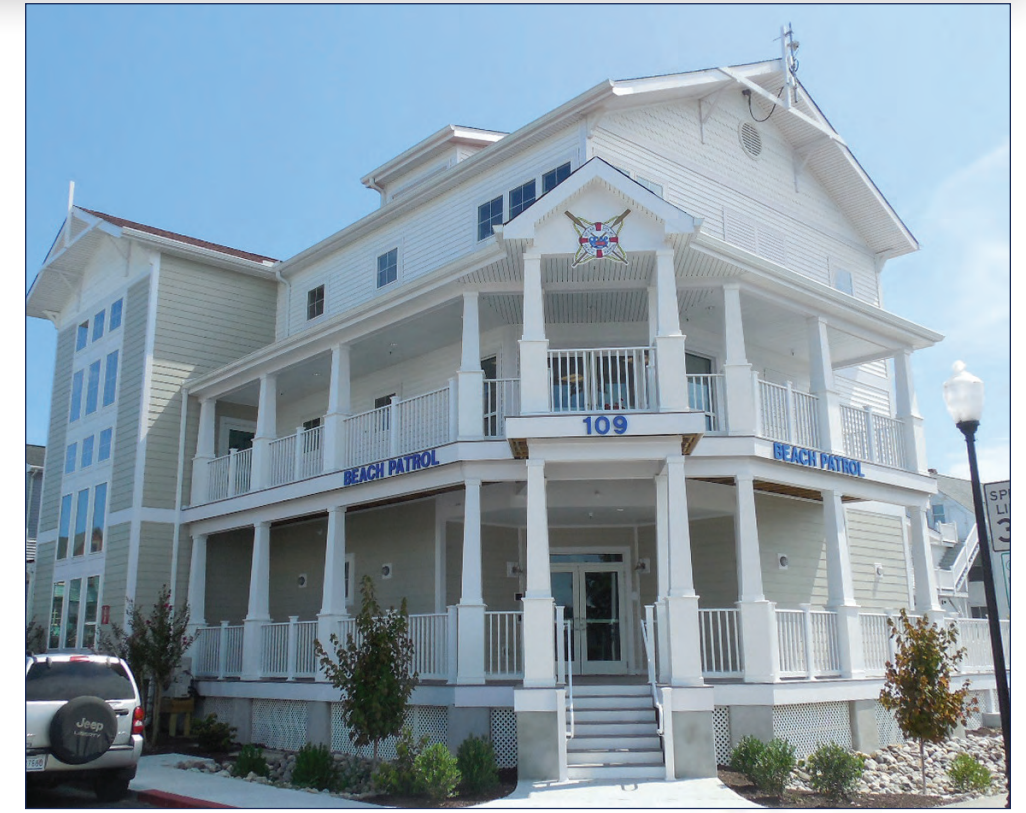
OC Beach Patrol Building at 109 Talbot Street

For the past three years the Town of Ocean City has been completing phased comprehensive street improvements along St. Louis Avenue between 17th Street and the Route 50 Bridge. This final phase was completed in May 2015. For each of these years, the OCDC has received generous funding assistance from the Maryland Department of Housing & Community Development to install decorative street lights with energy efficient LED lighting for each of these construction phases. This decorative lighting adds a lot to the pedestrian look of this residential street.