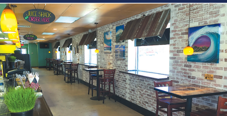
Top: Bayview Grand - 401 6<sup>th</sup> Street Bottom: Juice Shack/OC Wasabi Express - 1607 Philadelphia Avenue