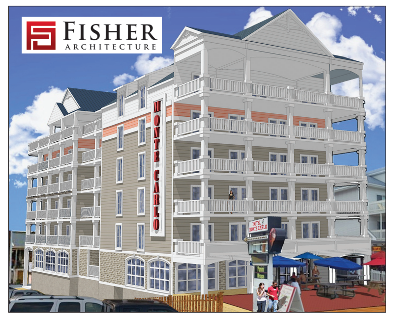
New Hotel Monte Carlo Oceanfront rendering formerly the Royalton Hotel - 1101 Atlantic Avenue