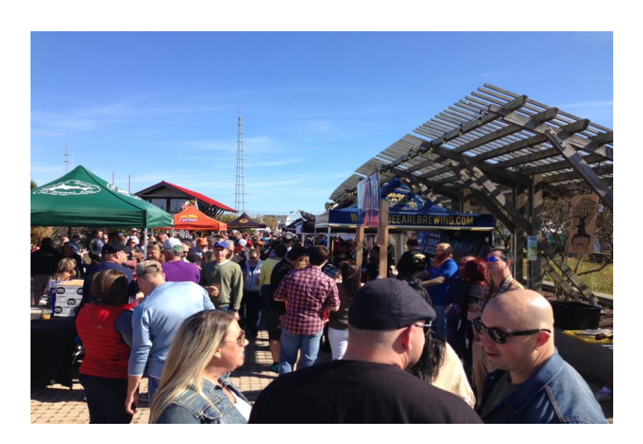
2016 craft beer festival held at Sunset Park

• In October 2016, the OCDC in partnership with ShoreCraft.com and the Town of Ocean City sponsored the first ever craft beer festival in downtown Ocean City at Sunset Park. This event was very successful and a second craft beer festival was held on October 29, 2016, which was even greater attended. A third event is planned for October 28, 2017.