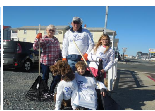
OC Clean Sweep volunteers in 2016