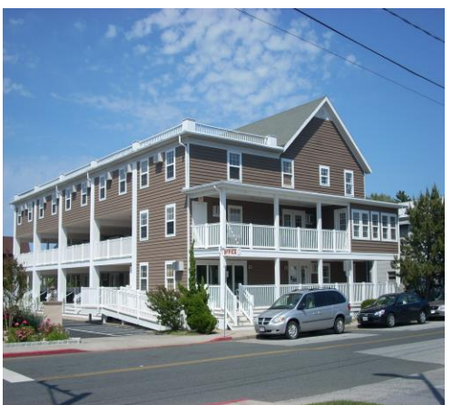
Before After The Ambassador Inn at Philadelphia Avenue and 5<sup>th</sup> Street