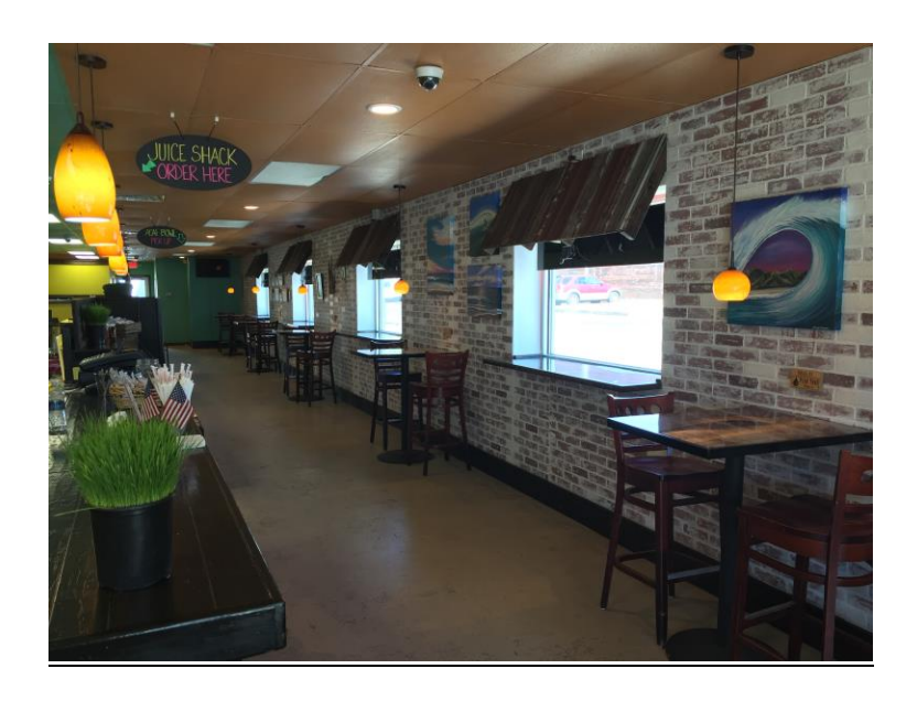
Interior improvements for Juice Shack/ OC Wasabi Express at 1607 Philadelphia Avenue