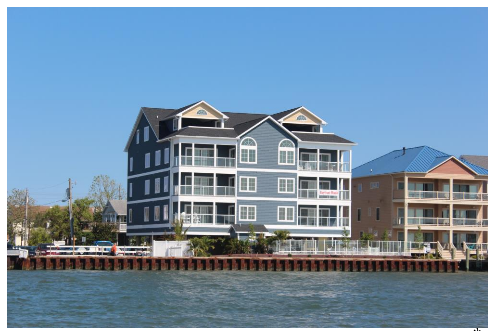
Bayview Condominiums completed in 2016 located at Edgewater Avenue and 5<sup>th</sup> Street