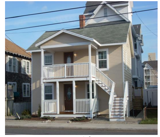
Before After 104 Philadelphia Avenue – residential property