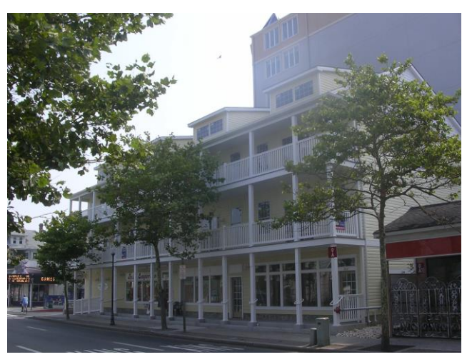
Boards Edge Villas mixed use project located at Baltimore Avenue and Talbot Street.