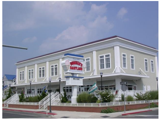
Dumsers Dairyland located on Philadelphia Avenue and Wicomico Street.