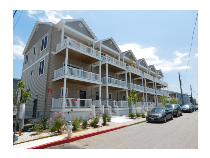
Island View Townhouses completed in 2015 at Edgewater Avenue and 5th Street.