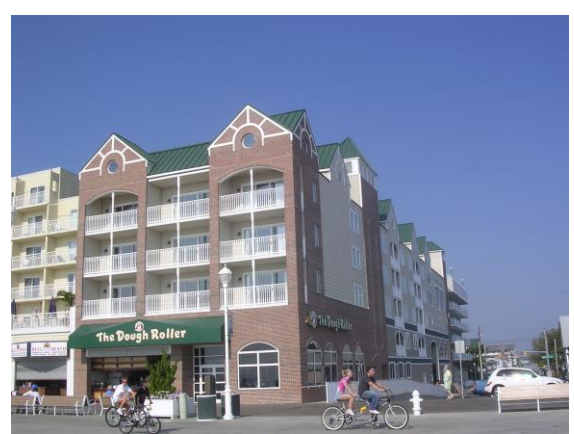
Breakers Hotel/Dough Roller Restaurant at Boardwalk and 3<sup>rd</sup> Street.