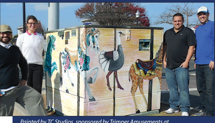
Painted by TC Studios, sponsored by Trimper Amusements at southeast corner of S. Baltimore Avenue and S. Division Street

program was busy this year. Artists from The Art League of Ocean City and TC Studios created new works of art on boxes at the following locations: S. Division Street, Caroline Street, Somerset Street, Wicomico Street, and Edgewater Avenue. Thanks to all of the individuals, community groups, and businesses who sponsored these projects. Sponsors are recognized with a metal plaque placed on the painted utility box. The painted utility box program is truly a community collaborative effort between the OCDC, Delmarva Power, community sponsors and local artists. If you're interested in sponsoring a painted utility box please call the OCDC at (410) 289-7739.