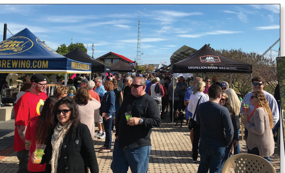
2017 Craft Beer Festival at Sunset Park

ShoreCraftBeer.com, OCDC, and the Town of Ocean City hosted the 3rd annual OCtoberfest craft beer festival at Sunset Park on October 28th, 2017. Approximately 1,200 people attended this year's event, enjoying the selections from 14 local breweries, 3 local food trucks, as well as many vendors. Live music was provided by The Poole Brothers. This year's ShoreCraft beer festival is scheduled for Saturday, October 27th at Sunset Park. Proceeds from this event fund free special events in downtown Ocean City.