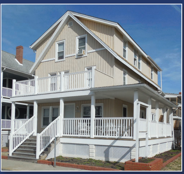
OCDC Facade Improvement Program Award - Sand Piper Apartments - 106 Dorchester Street