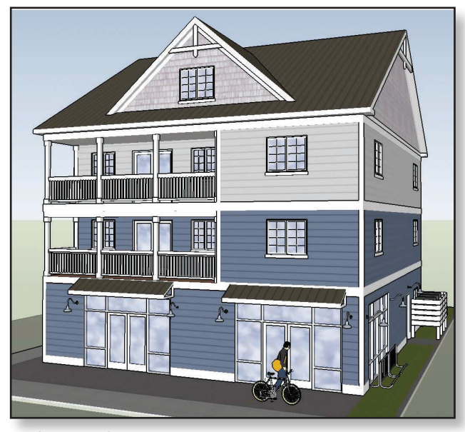
Rendering 16 Baltimore Avenue Project