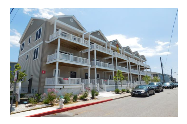
Island View Townhouses completed in 2015 at Edgewater Avenue and 5th Street.