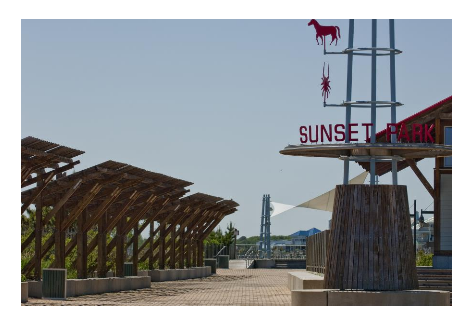
Sunset Park has become a favorite location for summer concerts and great views on the Bay.

Somerset Plaza is a semi-pedestrian walkway located between the Boardwalk and Baltimore Avenue. Music and car shows are held here throughout the summer.