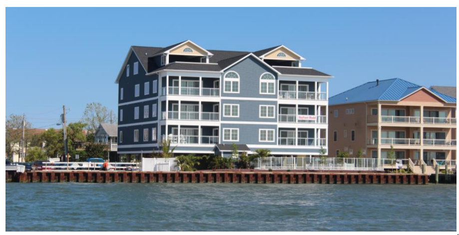
Bayview Condominiums completed in 2016 located at Edgewater Avenue and 5<sup>th</sup> Street