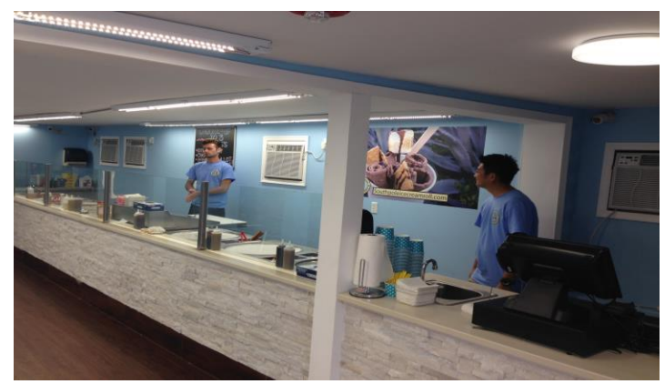
Interior improvements for South Pole Ice Cream at 10 N. Division Street