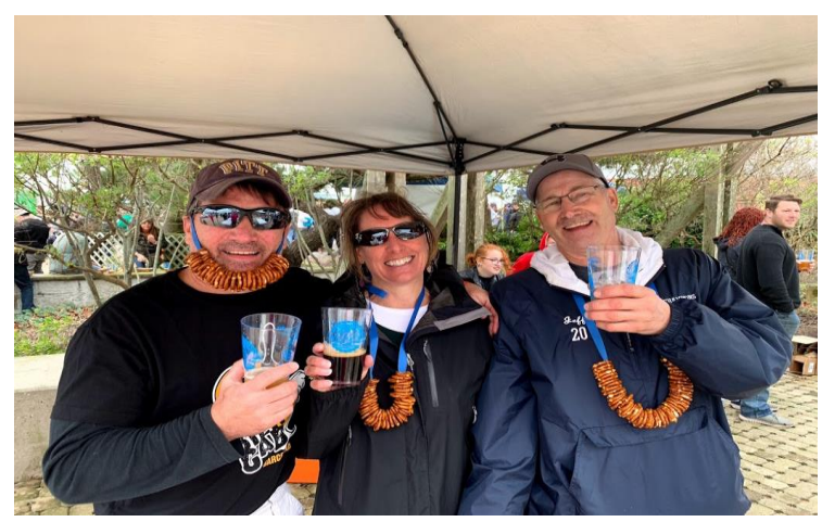
2018 craft beer festival held at Sunset Park