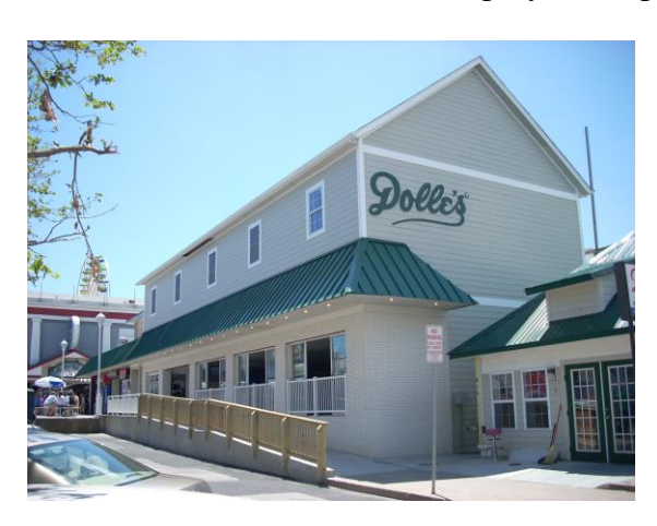
Dolle's mixed use project on Wicomico Street near Boardwalk.

Since 2000, there have been numerous new private sector projects constructed in downtown Ocean City. Many of these projects have been completed by people and families who have been in the downtown area for many years and several generations. Each new project has added to the excitement of the downtown area as well as increased the tax base and employment opportunities.