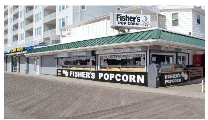
After (new raised awning and screening of mechanical equipment) 200 S. Atlantic Avenue – commercial property