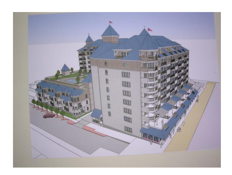
Belmont Towers mixed use project at Boardwalk and Dorchester Street.