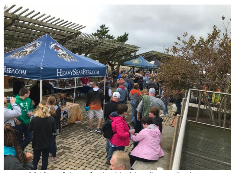
2018 craft beer festival held at Sunset Park