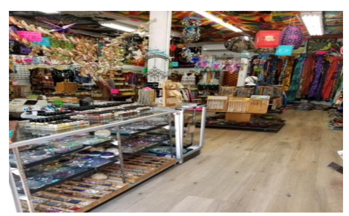
Interior improvements for India Emporium at 109 S. Baltimore Avenue