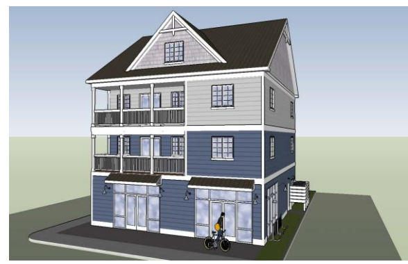
16 Baltimore Avenue rendering (after)