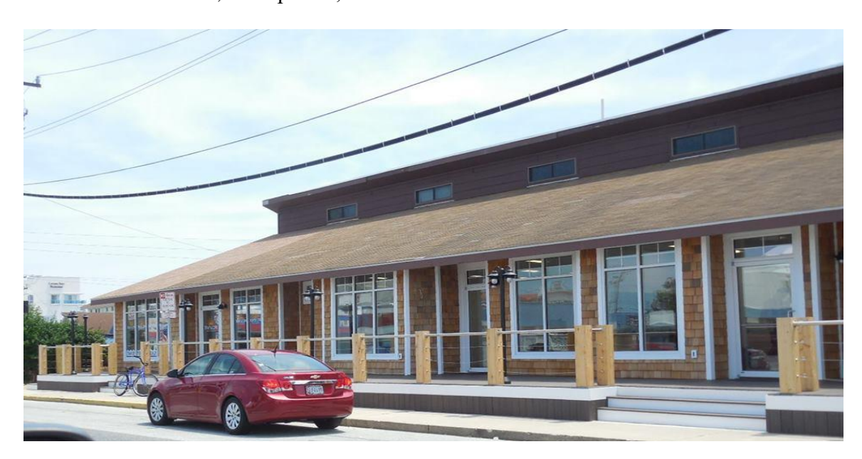
209 16<sup>th</sup> Street – commercial property