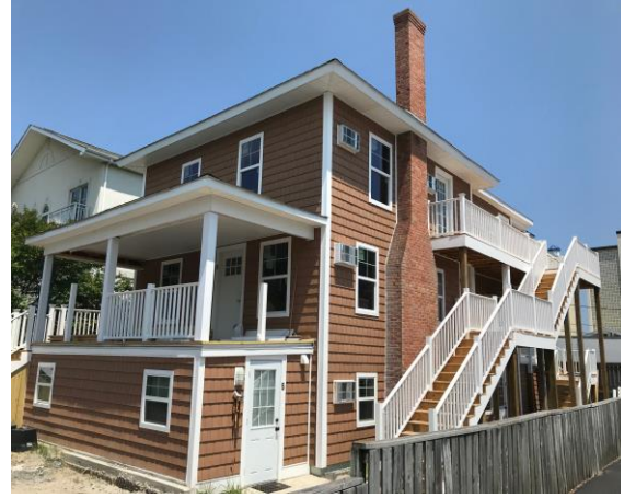
Before After 1201 Baltimore Avenue – residential property