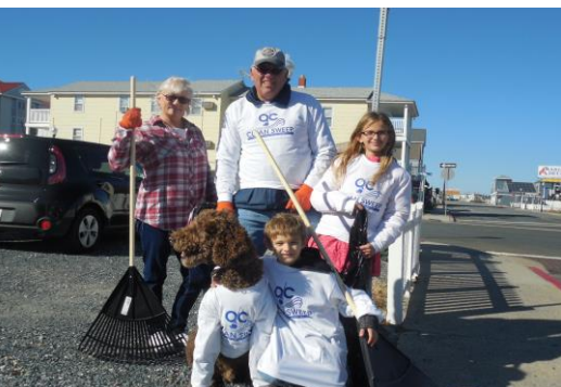
OC Clean Sweep volunteers in 2017