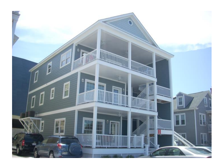
New residential building constructed in 2013 on 12<sup>th</sup> Street.