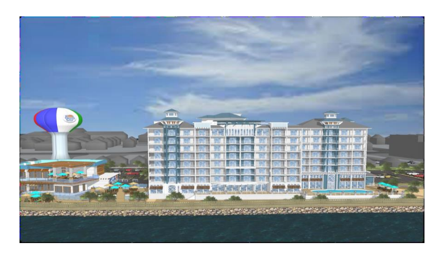
Proposed Cambria Hotel rendering Opening 2020 – 126 rooms with restaurant