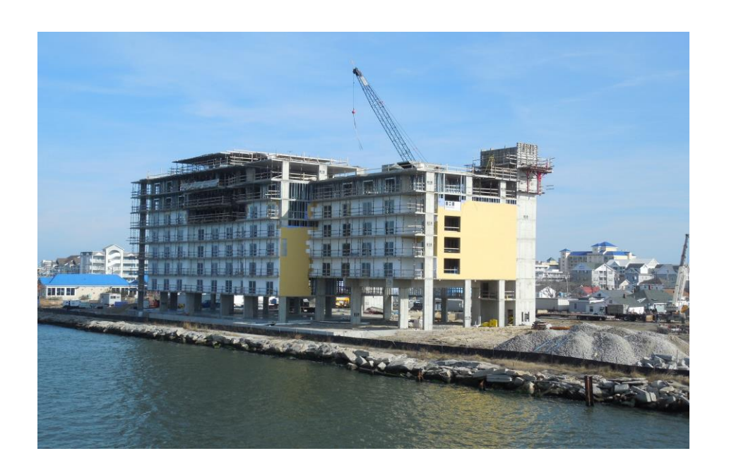
Cambria Hotel Currently under construction