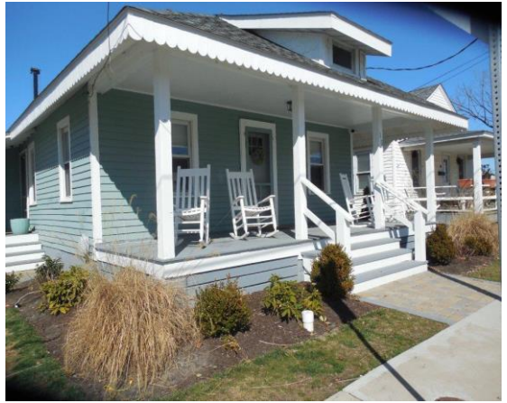
Before After 15 St Louis Avenue – residential property