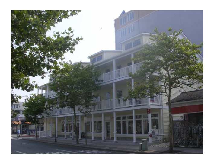
Boards Edge Villas mixed use project located at Baltimore Avenue and Talbot Street.

Dumsers Dairyland located on Philadelphia Avenue and Wicomico Street.