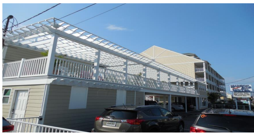
After (new trellis and siding improvement) 7and 9 Baltimore Avenue – commercial property