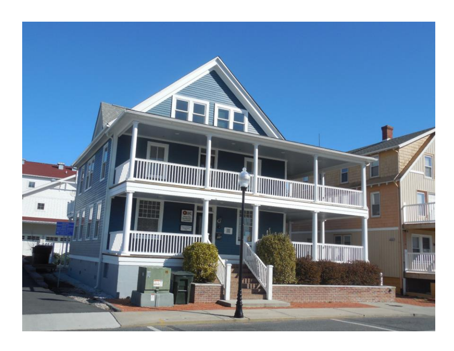
The Tarry-A-While Guest House was constructed in 1897 and fully renovated.