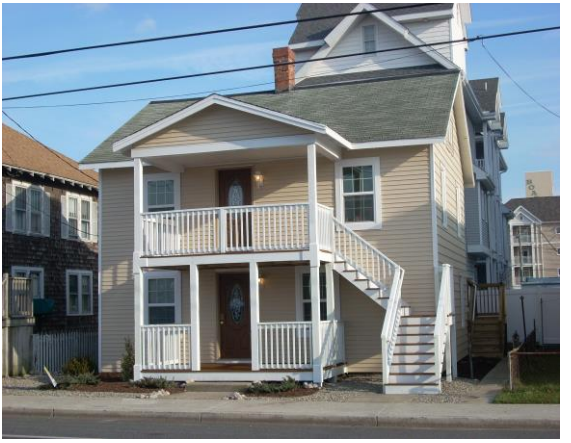
Before After 104 Philadelphia Avenue – residential property