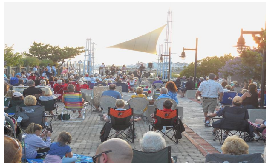
2018 Sunset Park Party Nights