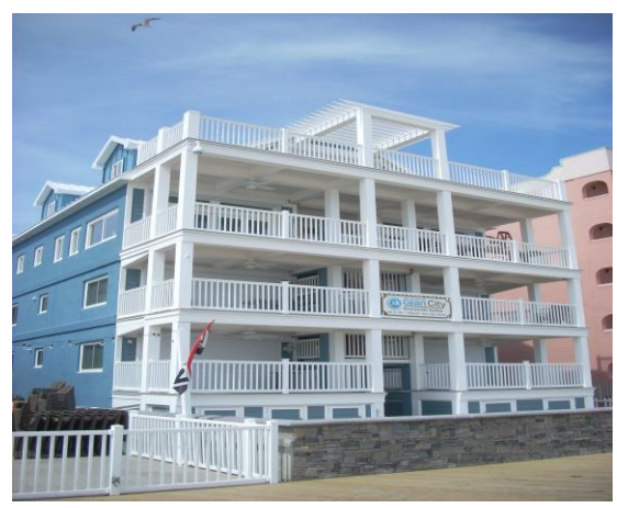
After (new porches and railings) 505 Atlantic Avenue – residential property