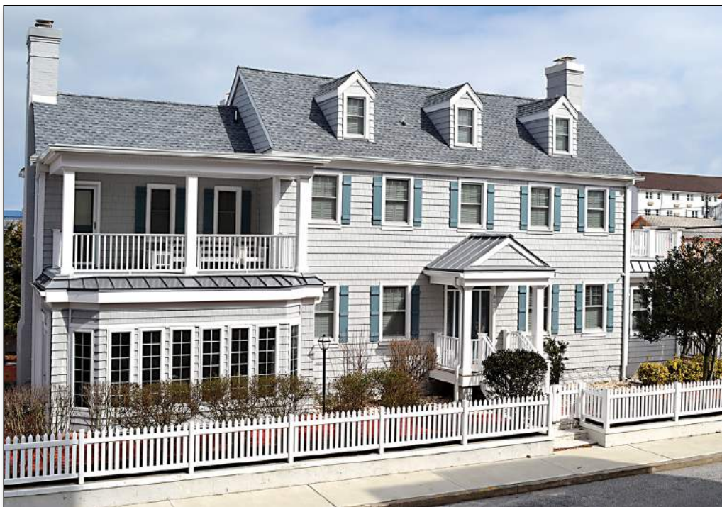
New Facade Project - 601 Baltimore Avenue

As of February, 2019 217 buildings have been renovated using the OCDC Façade Program in downtown Ocean City south of 17th Street. There were 17 façade projects completed in 2018 alone! There are currently several façade projects underway. This past year saw some of the best façade projects completed under this program since the program started in 2002.