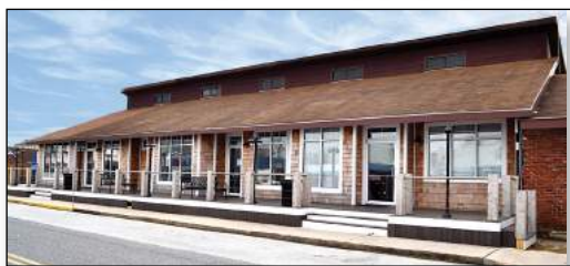
New Facade Project - 209 16th Street