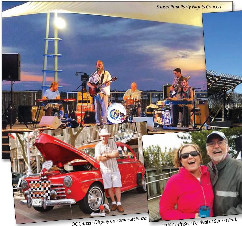
OC Cruzers Display on Somerset Plaza

The OCDC will be providing free music and the OC Cruzers will be displaying their custom cars on Somerset Plaza this summer on select Sunday dates. For more information on Sunset Park Party Night performances, dates for Somerset Plaza events and other events like us on Facebook or go to www.ocdc.org .