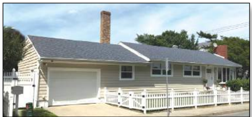
New Facade Project - 300 14th Street