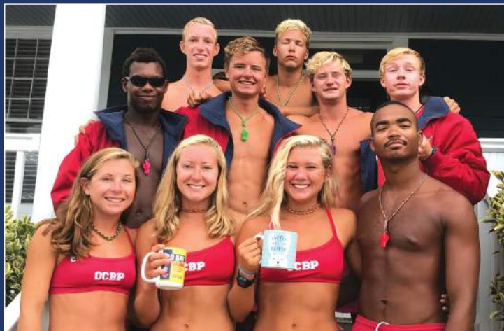
Tarry-A-While Guest House located at 108 Dorchester Street

For its twelfth year, the OCDC provided and managed seasonal housing for Town of Ocean City seasonal employees. Since 2007 thirteen employees of the Ocean City Beach Patrol have resided at the Tarry-A-While Guest House that was constructed in 1897 and fully renovated in 2007. It is often difficult to find affordable housing for seasonal employees and the Tarry-A-While building offers such housing.