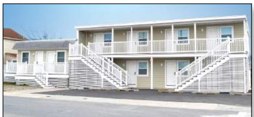
New Facade Project - 2 St. Louis Avenue