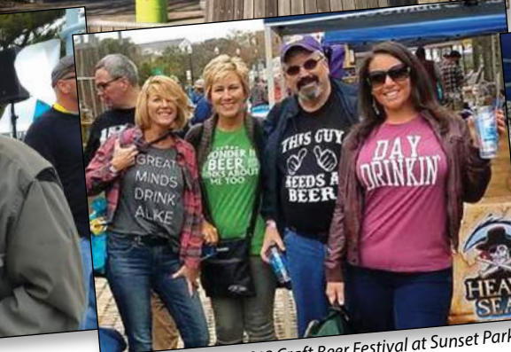
2018 Craft Beer Festival at Sunset Park

ShoreCraftBeer.com, OCDC, and the Town of Ocean City hosted the 4th annual Octoberfest craft beer festival at Sunset Park on October 27th, 2018. Approximately 1,400 people attended this year's event, enjoying the selections from 14 local breweries, three local food trucks, as well as many vendors. Live music was provided by The Johnny Bling Band. This year's ShoreCraft beer festival is scheduled for Saturday, October 26th at Sunset Park. Proceeds from this event fund free special events in downtown Ocean City. For additional information and ticket purchases, visit www.shorecraftbeer.com .