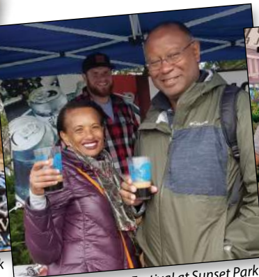
2018 Craft Beer Festival at Sunset Park