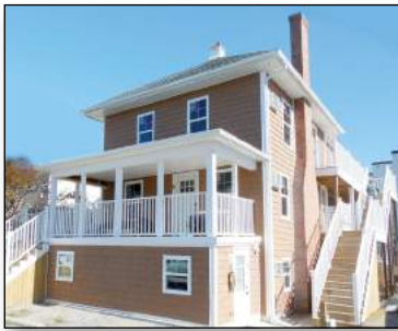
New Facade Project - 1202 Baltimore Avenue

In 2018, OCDC started a new program to bring energy efficient LED lighting to alleys in the downtown area. OCDC is providing a match of up to $500 for businesses and property owners to install such lighting. This lighting not only helps in public safety but also improves the visibility for pedestrians and bicyclists who often use these alley ways to get around downtown. The first stage of this program targeted Washington Lane from 4th to 10th Street. Washington Lane is the alley that runs parallel closest to the Boardwalk. Three new light projects were completed so far. OCDC just expanded this program to additional streets along Washington Lane and will look at other downtown alleys, too.