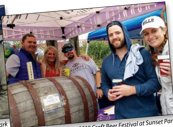
2018 Craft Beer Festival at Sunset Park