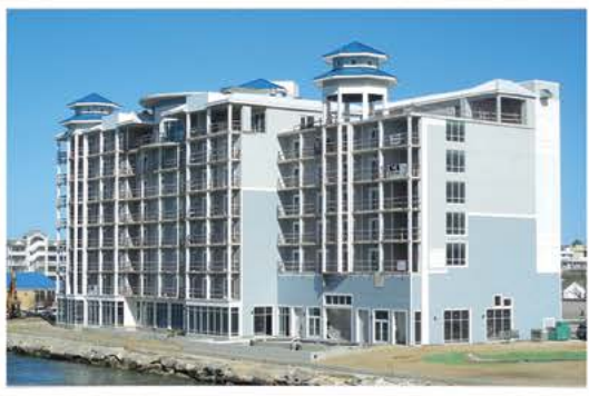
Cambria Hotel near Route 50 Bridge under construction and expected to open for summer 2020