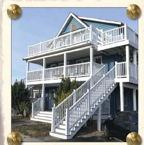
Facade project at 407 St. Louis Avenue