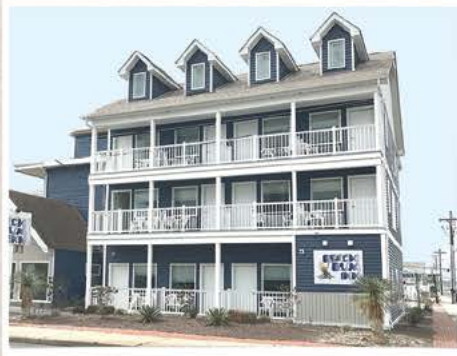
New Beach Bum Inn at 211 Baltimore Avenue opened for summer 2019.