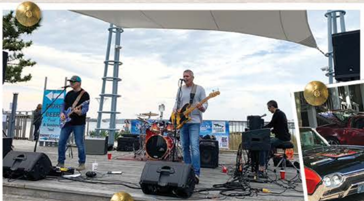
Left: Sunset Park Party Nights Bottom: Somerset Plaza OC Cruzers display

The OCDC will be providing music and the OC Cruzers will be displaying their custom cars on Somerset Plaza this summer on six Sunday dates. For more information on Sunset Park Party Night performances, dates for Somerset Plaza events and other events like us on Facebook or go to www.ocdc.org .