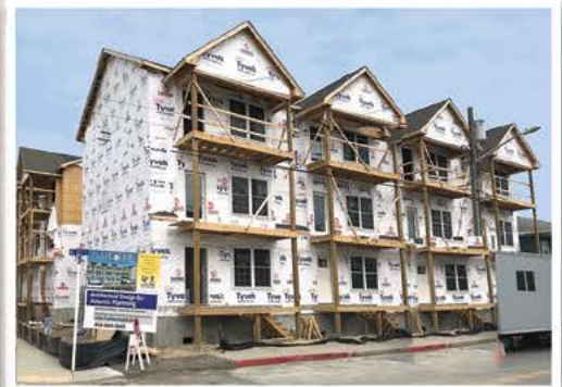
Island Time townhouses at St. Louis Avenue and 12th Street under construction.