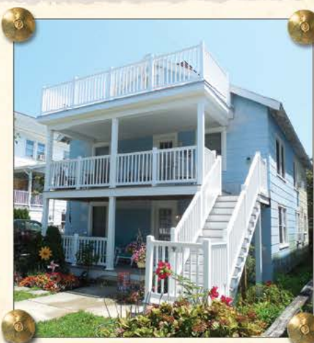
Facade project at 1004 Baltimore Avenue

The OCDC Façade Program has an incredible impact on the appearance of many buildings. To date, over $6.7 million has been invested into downtown Ocean City through this program. These newly renovated projects greatly increase the taxable value thus benefiting all Ocean City and Worcester County residents. Funding for the OCDC Façade Program is made available from DHCD's Community Legacy Program.