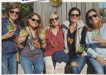
Friends and fun at the 5th Annual Octoberfest held at Sunset Park.