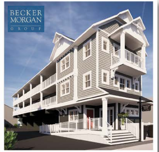
Proposed 11 unit motel at 803 Philadelphia Avenue