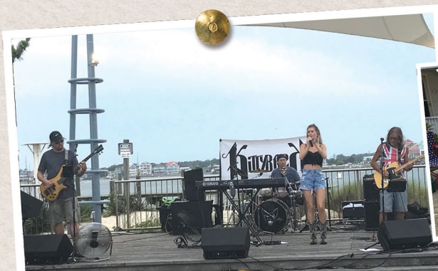
Left: Sunset Park Party Nights Bottom: Somerset Plaza OC Cruzers display

The OCDC will be providing music and the OC Cruzers will be displaying their custom cars on Somerset Plaza this summer on eight Sunday dates. For more information on Sunset Park Party Night performances, dates for Somerset Plaza events and other events like us on Facebook or go to www.ocdc.org .