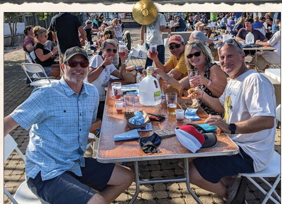
Above: Private Table Seating at Octoberfest Right: Full Circle Duo