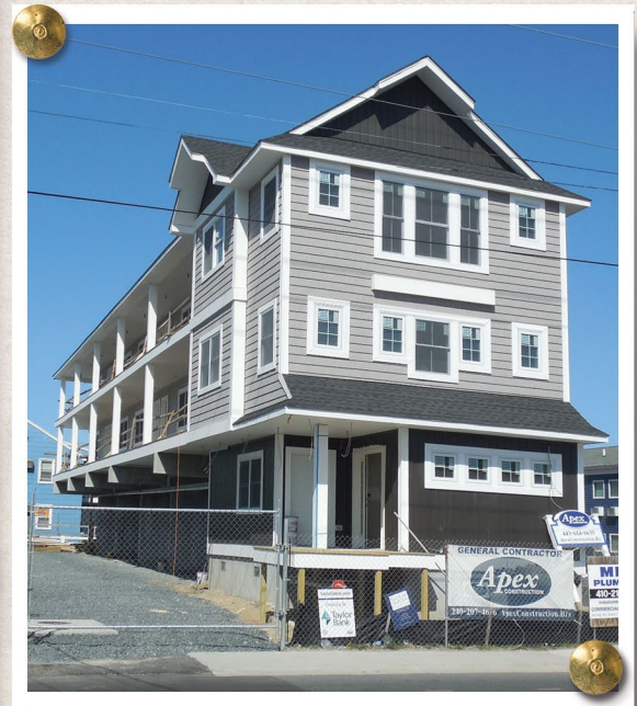
New Hotel at 803 Philadelphia Avenue