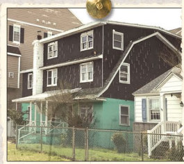
Before and during construction at 207 St. Louis Avenue

OCDC has approved funding towards the renovation and partial new construction project at 207 St. Louis Avenue. This project is being funded as part of the OCDC's new Development and Assistance Program which provides grants to projects providing investment in new and renovation of employee housing units in downtown Ocean City.