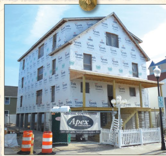
104 Dorchester Street