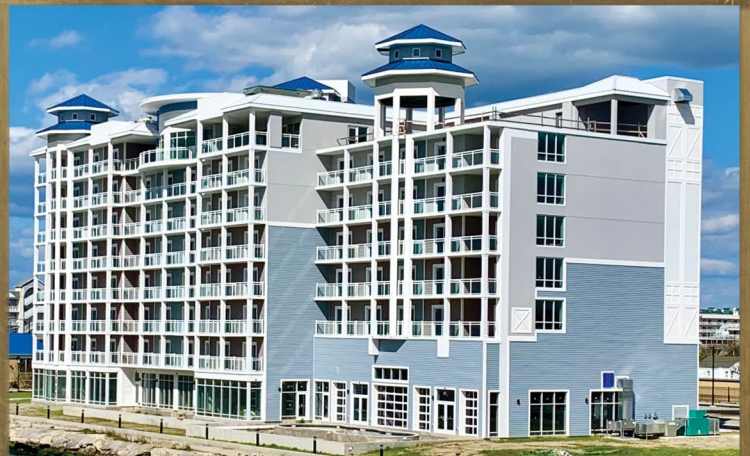
Cambria Hotel - 1st Street on the Bay