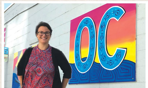
DORCHESTER STREET WALL MURALS BY ALI JACOBS OF TC STUDIOS