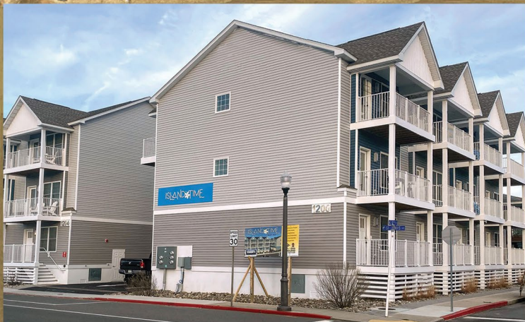
Island Time Townhouses - St. Louis Avenue & 12th Street