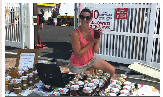
TRIMPER RIDES NEW FARMERS MARKET ON S. 1ST STREET OFF THE BOARDWALK

The 2021 OCDC/Art Davis Tournament will be held on October 6, 2021 for anyone interested in playing.