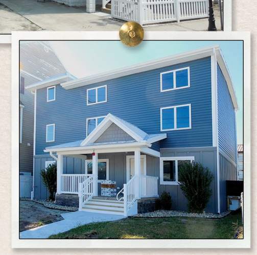
Middle: Employee Housing at 104 Dorchester St. Bottom: Employee Housing at 207 St. Louis Ave.