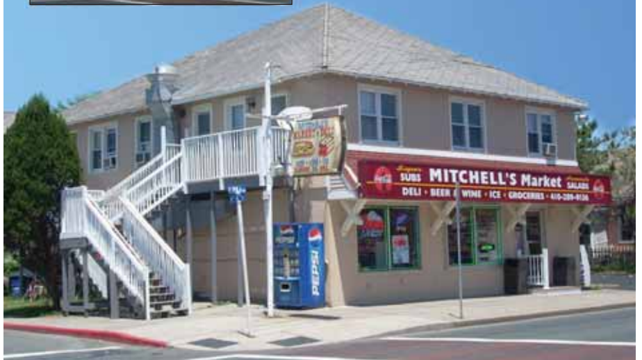
401 Philadelphia Avenue ( Before and After)