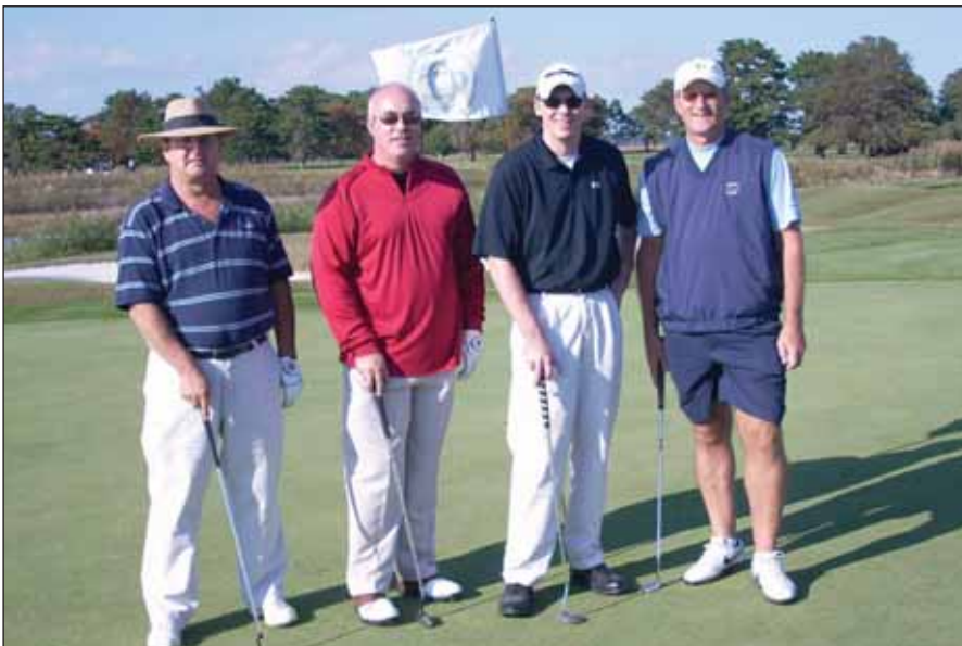
Comcast Spotlight Team

In October 2010 the OCDC held its 10th annual golf tournament to raise funds for its downtown redevelopment program. Sysco Eastern Maryland, LLC was once again the prime sponsor of our golf tournament. This year's golf event was the OCDC's most successful fundraising tournament.