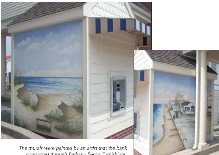
The murals were painted by an artist that the bank contracted through Bethany Resort Furnishings.

Old Ocean City pictures painted on the Farmers Bank of Willards ATM, located at 200 S. Philadelphia Ave.