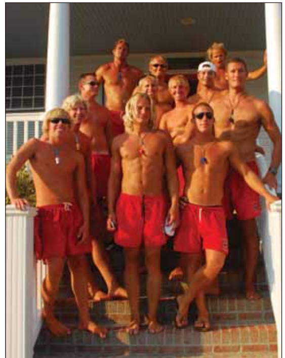
Tarry-A-While Guest House Resident Lifeguards Summer 2010

For its fourth year, the OCDC has provided and managed housing for Ocean City Beach Patrol employees. Since 2007, each summer, thirteen employees have resided at the Tarry A While Guest House that was constructed in 1897 and fully renovated in 2007. Ten additional Beach Patrol employees are provided housing at 110 Somerset Street.