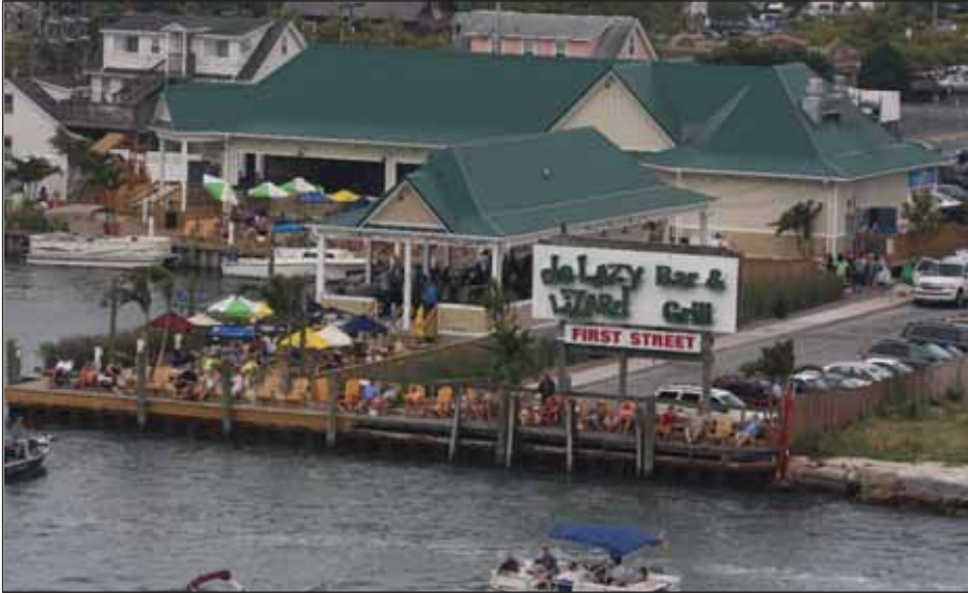
DeLazy Lizard Bar and Grille

The DeLazy Lizard Bar and Grille opened in June 2010. This new downtown hotspot is located on the Bay at 1st Street. Its construction adhered to the downtown design standards.