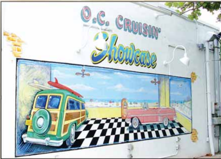
Wall Mural on Talbot Street