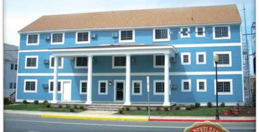
100th Façade Project - The Buckingham Hotel at 1405 Baltimore Avenue