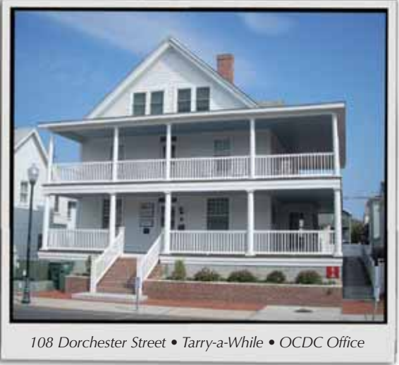
108 Dorchester Street • Tarry-a-While • OCDC Office