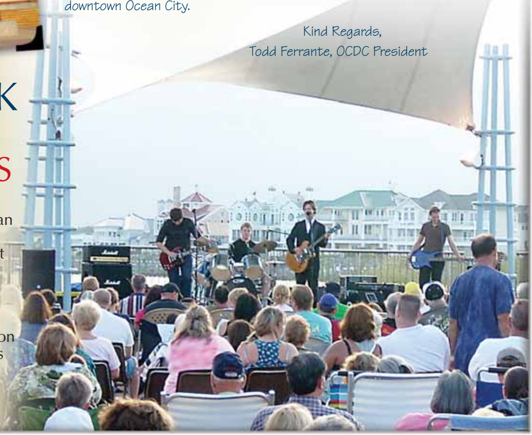
"Back to the Beatles" band performing at Sunset Park in August 2011

The OCDC looks forward to partnering with the Town of Ocean City to bring another summer of Sunset Park Party Nights to Sunset Park. These events will be held each Thursday night in July and August starting at 7:00 pm. These events are free and open to the public. The Ocean City Recreation Boosters will be selling beverages and beer at each event. Proceeds from such sales go to youth programs in Ocean City.