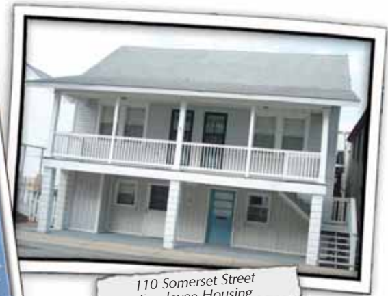
110 Somerset Street Employee Housing

For its fifth year, the OCDC has provided and managed seasonal housing for Ocean City Beach Patrol employees. Since 2007 thirteen employees have resided at the Tarry A While Guest House that was constructed in 1897 and fully renovated in 2007. Ten additional Beach Patrol employees are provided housing at 110 Somerset Street. The OCDC expects to provide additional employee housing for seasonal City staff for up to 26 people at the recently purchased residential buildings on Dorchester Street. Between its four managed buildings the OCDC will manage about 50 beds.