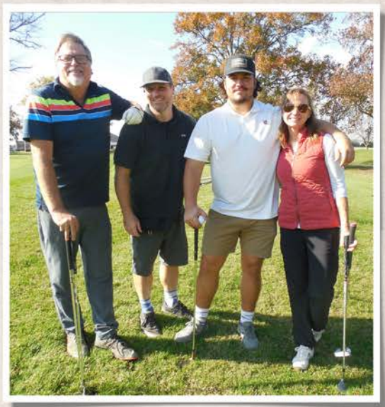
2022 Tournament Participating Team Papi's Tacos

Thanks to the 28 teams, our many sponsors, business donations, and volunteers, this year's golf tournament was a success! Though the tournament was postponed to November 1st due to rain, participation remained strong.