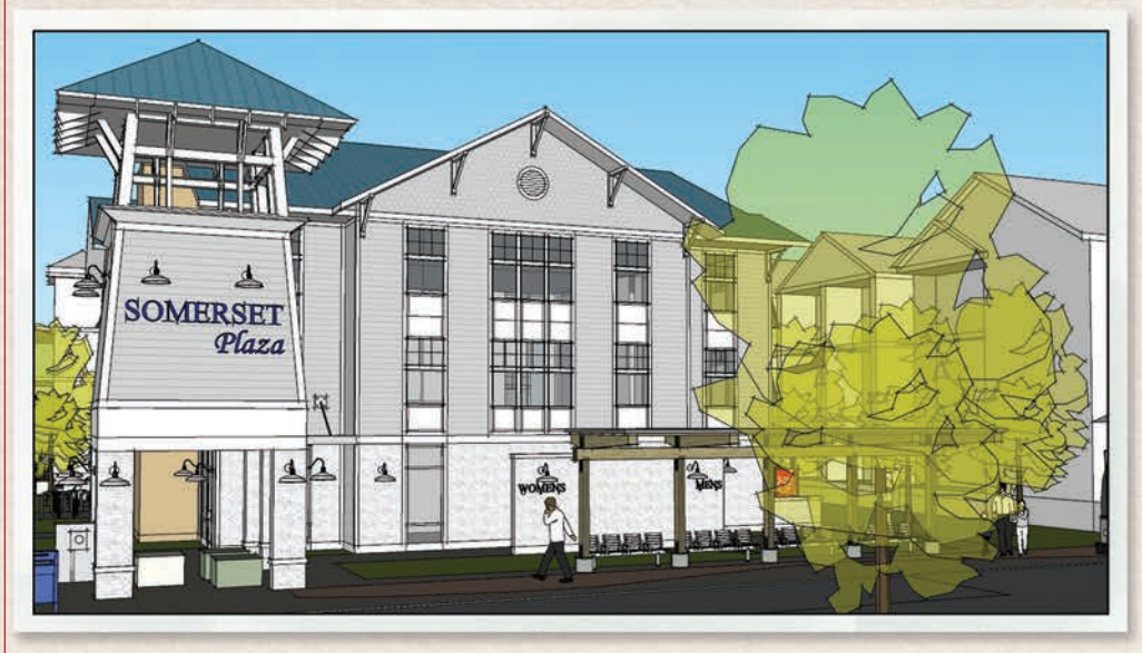
Rendering of proposed OCPD Mixed-Use Facility

With the Town of Ocean City's assistance and support, the OCDC moves ahead with the proposed Ocean City Police Department mixed-use facility. This project has been added to the Fiscal Year 2024 Capital Improvement Plan for the Town of OC. Elected officials and Town staff favorably ranked the project, and if funded, construction will likely begin in late 2023. This new facility will include a more attractive bus shelter, public restrooms, a full-service facility for the OCPD bicycle unit, and upper floor housing for the Town's seasonal employees. The facility will be built where the current municipal parking lot is located at the southwest corner of S. Baltimore Avenue and Somerset Street.