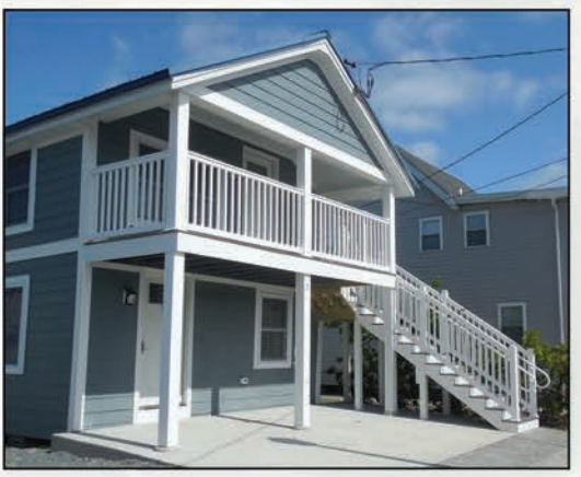
Top Photo: 302 11th Street Bottom Photo: 3 St. Louis Avenue