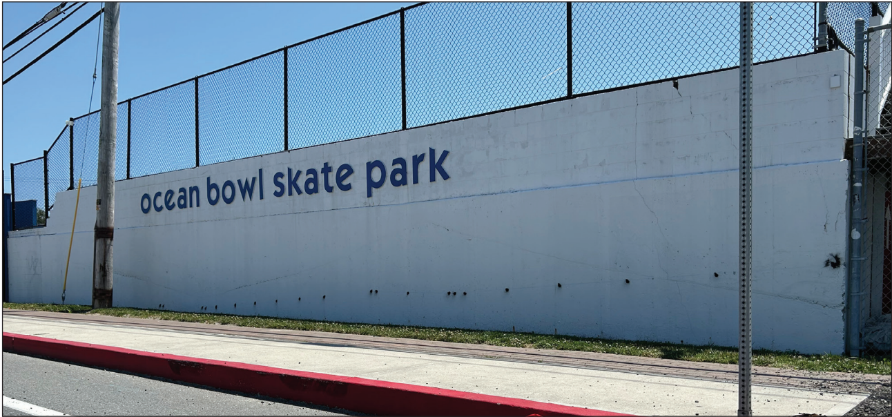
Black dots represent approximate location of future wheelchair ramp and railing.

Site History: The Ocean Bowl Skate Park is the oldest operating municipal skate parking in the United States. The Park is a point of pride and has high cultural and historical value for many residences of Ocean City and the surrounding area. It has had numerous expansions over the years to reflect evolutions in the sport of skateboarding. The Ocean Bowl Skate Park has been a breeding ground for “local legends” and hosted numerous professional skateboarders over the years.