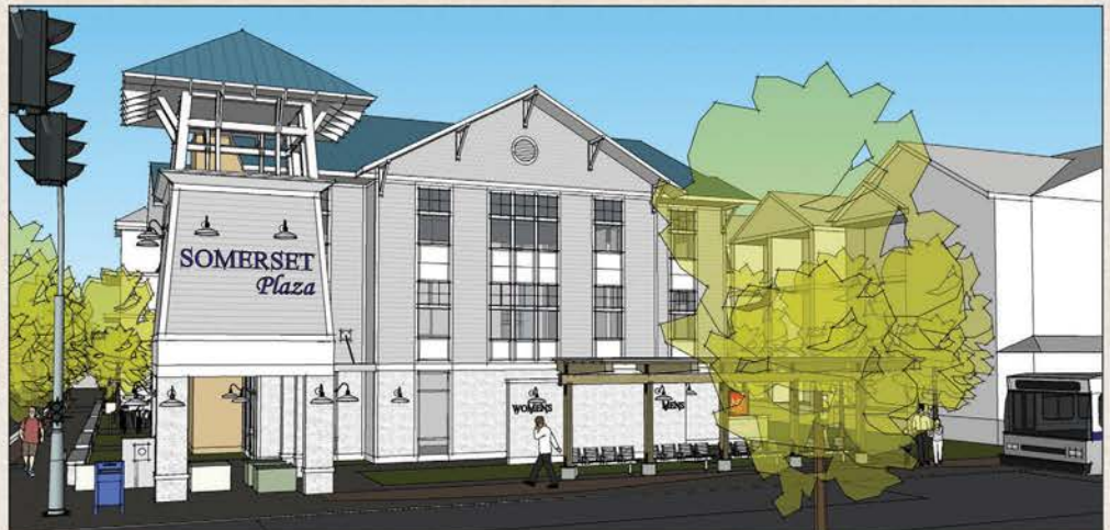
Rendering of proposed OCPD Mixed-Use Facility

building will also include convenient public restrooms. Funding for this project will come from the Town of Ocean City and the OCDC. Thanks to our partners at the Town of Ocean City, as well as our private partners at Gillis Gilkerson Inc. and the Becker Morgan Group, whose collaborative efforts helped bring this project to fruition.