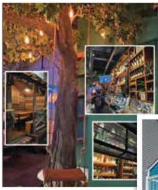
ABOVE: Business Assistance Award Recipient The Treehouse