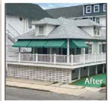
The owners of this 6th street property recently utilized our Façade, Green Building, and Roof programs.